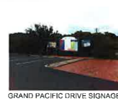
GRAND PACIFIC DRIVE SIGNAGE