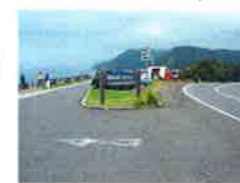
OBSCURE SITE ENTRY