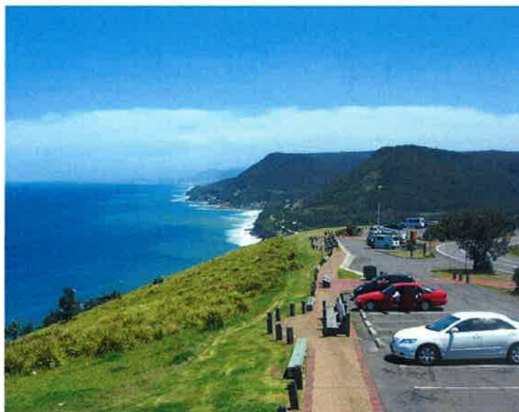
MAGNIFICENT COASTAL VIEWS OF THE ILLAWARRA