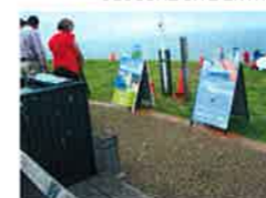
TOURIST OPERATORS ADVERTISING