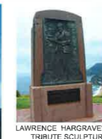
LAWRENCE HARGRAVE'S TRIBUTE SCULPTURE