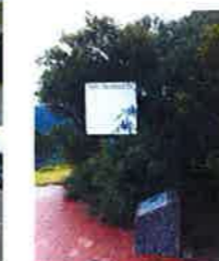
HANG GLIDING CLUB SIGNAGE