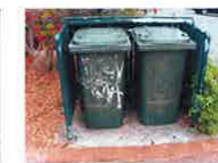
DATED STREET FURNITURE