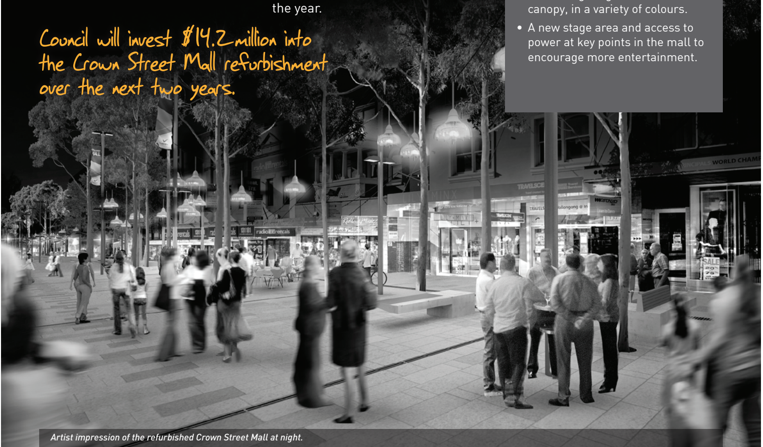
Artist impression of the refurbished Crown Street Mall at night.

Council will invest $14.2 million into the Crown Street Mall refurbishment over the next two years.