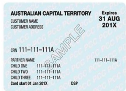
Pensioner Concession Card issued by the Department of Health and Human Services

I will be asked a few questions and given some information about what I can borrow. I will receive a library card and this makes me a member of the library.