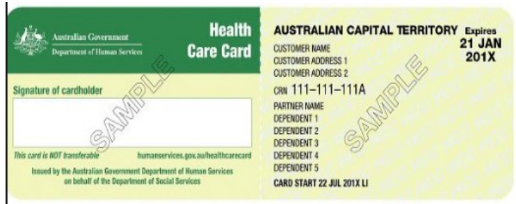
Health Care Card issued by Department of Health and Human Services

I will need to bring two forms of identification. This can be a driving licence, bank statement, rental receipt or household bill. One of them will need to show my name and address such as a concession card.