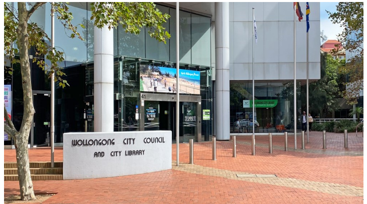
Entrance to Council and Library

Wollongong Library has activities like badgemaking, K-pop, and arcade games.