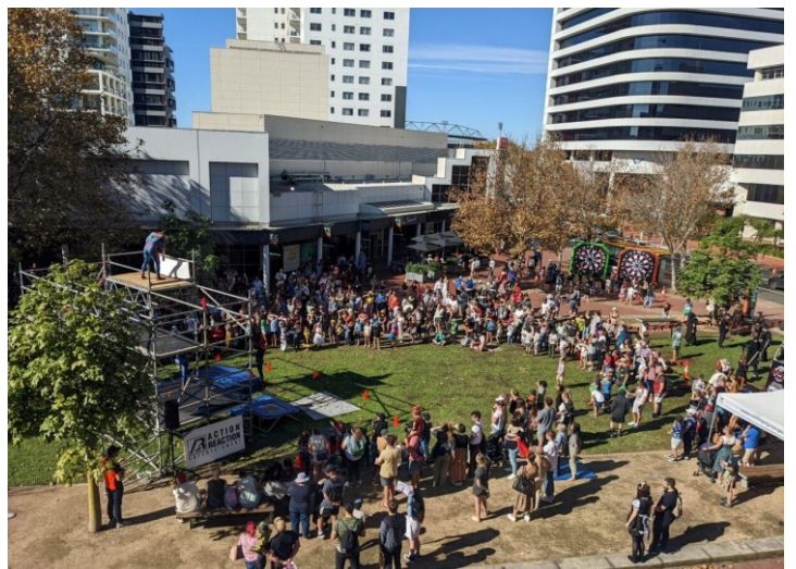
Arts Precinct Plaza Green Space

The Arts Precinct Plaza has live shows, music, and gaming.