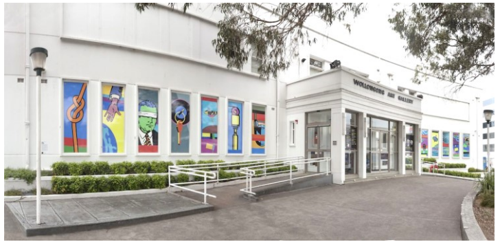
Entrance to Art Gallery

The Art Gallery has cosplay competitions.