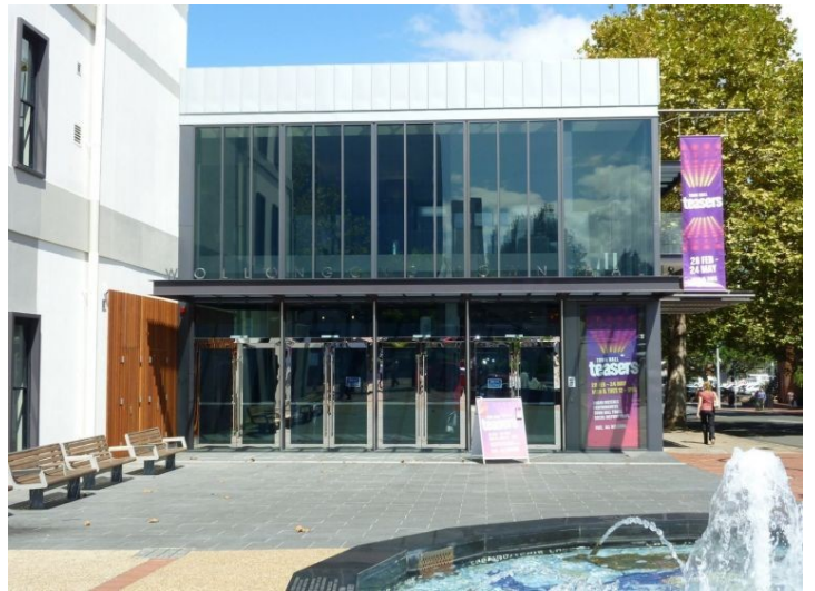
Entrance to Town Hall

The Town Hall has stalls where I can look and buy merchandise.