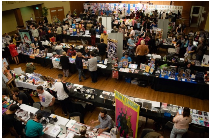
Town Hall - Auditorium

The Town Hall has stalls where I can look and buy merchandise.