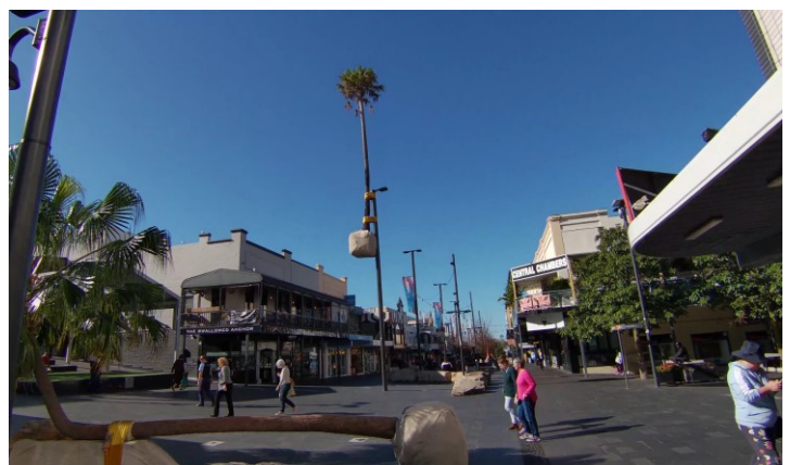
Lower Crown Street Mall

Lower Crown Street Mall has live performances.