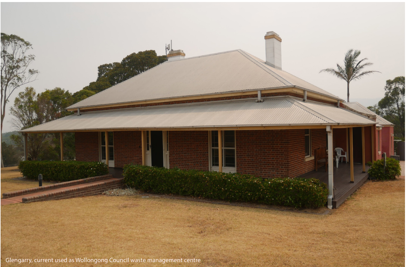
Glengarry, current used as Wollongong Council waste management centre

Heritage NSW Recommendation 8 - Set a good example to the community by properly managing heritage places owned or operated by the council