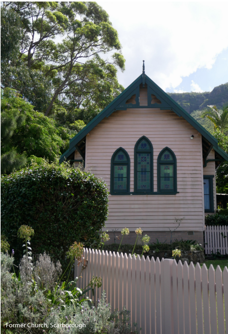
Former Church, Scarborough

We will do this by working with the community to: identify; acknowledge; conserve; protect; document; record; interpret; promote; and manage, the significant: places; objects; records; stories; and memorials, of our past, for the benefit, enjoyment, and appreciation of future generations.