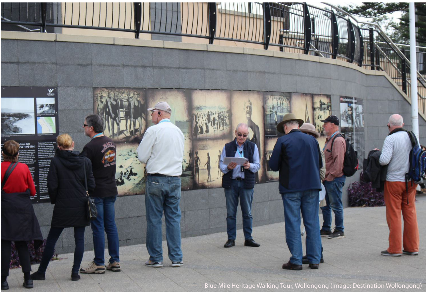
Blue Mile Heritage Walking Tour, Wollongong

It is important to acknowledge that increased tourism can have an impact on cultural values and sensitive ecological areas that must be appropriately managed.