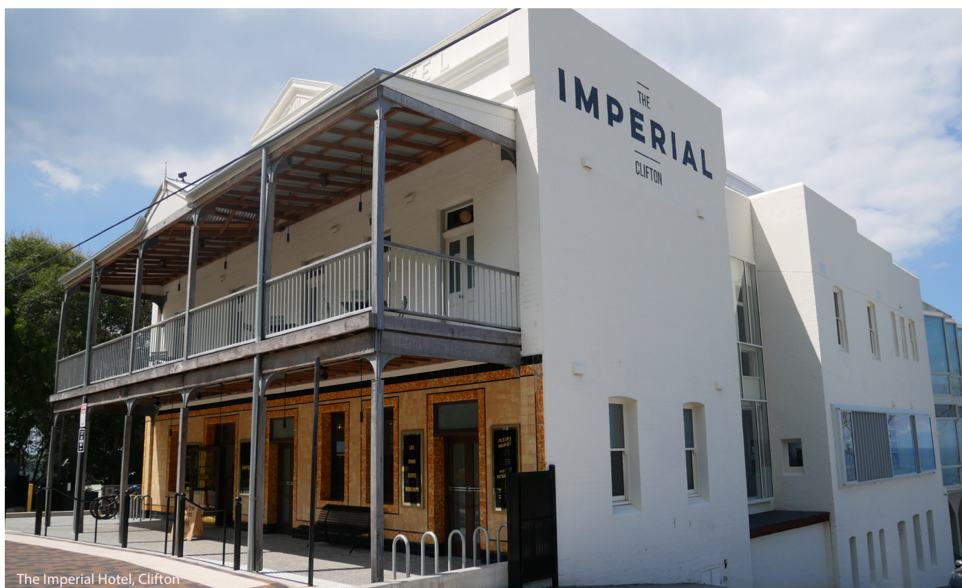
The Imperial Hotel, Clifton

Each strategy is linked with a recommendation from the Heritage NSW publication 'Recommendations for Local Council Heritage Management'.