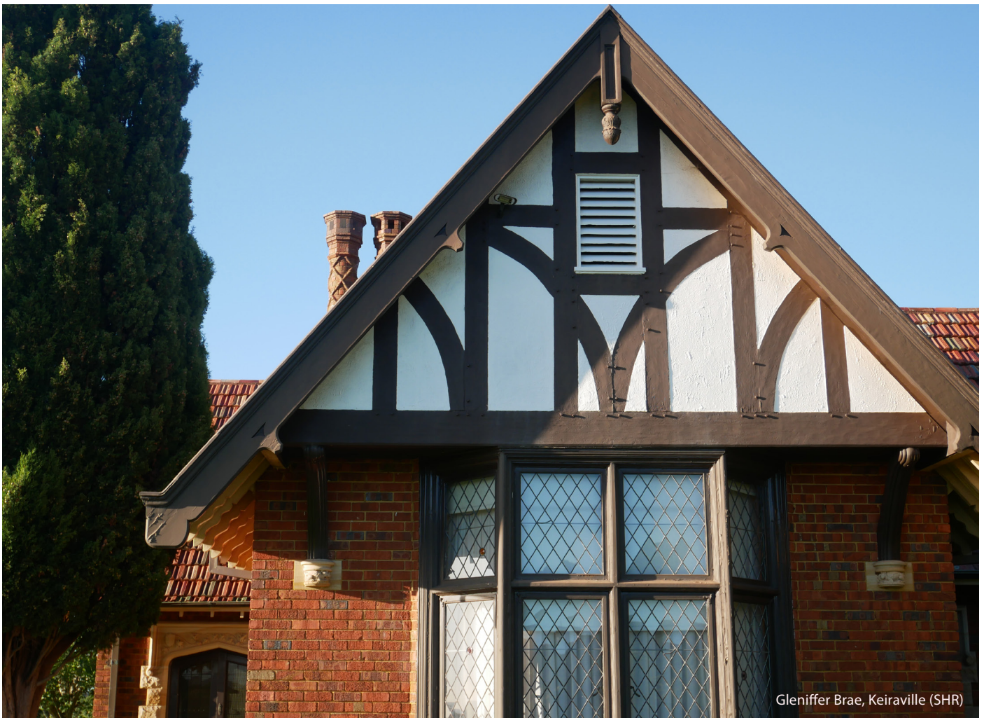
Gleniffer Brae, Keiraville (SHR)

Council is also committed to the development and implementation of an internal staff training programs as well as the continued implementation of our Reconciliation Action Plan.