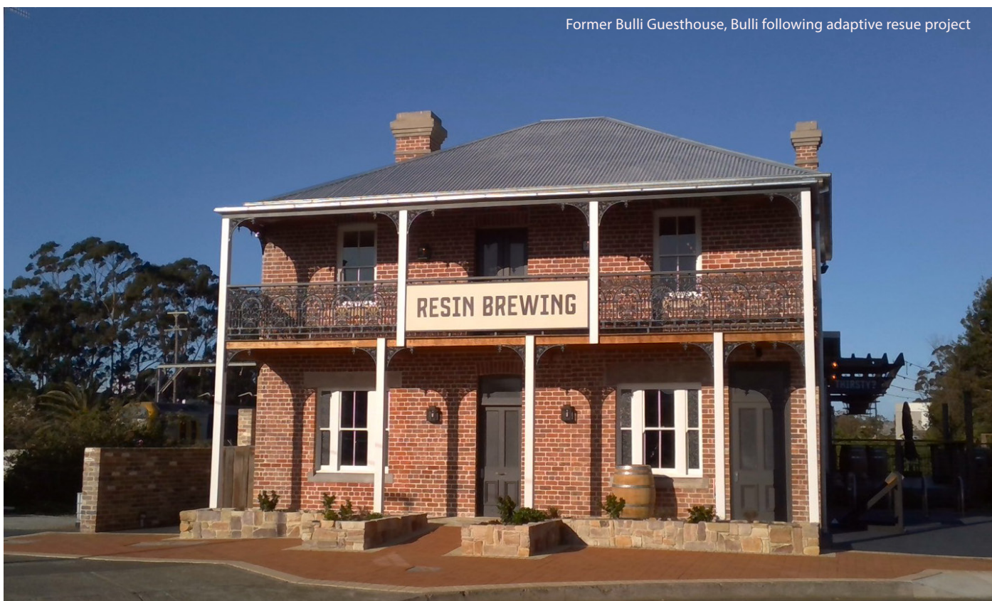
Former Bulli Guesthouse, Bulli following adaptive reuse project

Heritage NSW Recommendation 4 - Manage local heritage in a positive manner