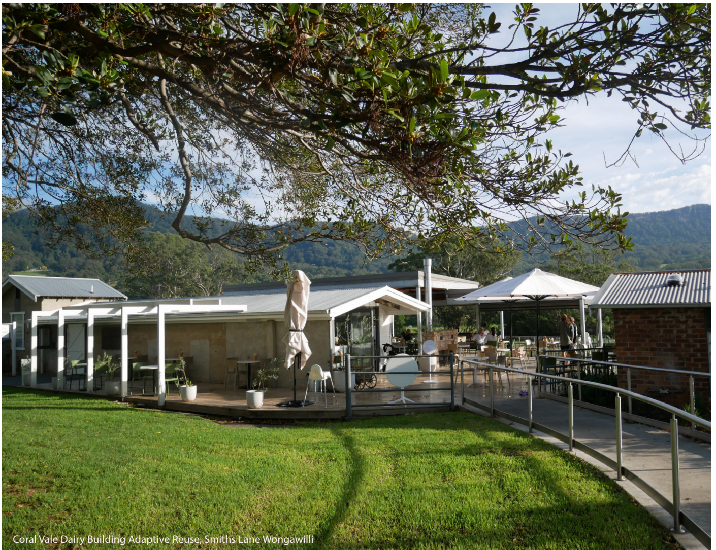
Coral Vale Dairy Building Adaptive Reuse, Smiths Lane Wongawilli

Council has run a successful local heritage grant program for the past 15 years and will continue to support local heritage owners to achieve positive conservation outcomes. Council will also continue to actively pursue available heritage funding from other levels of government, including Heritage NSW Local Government Heritage Grants program.