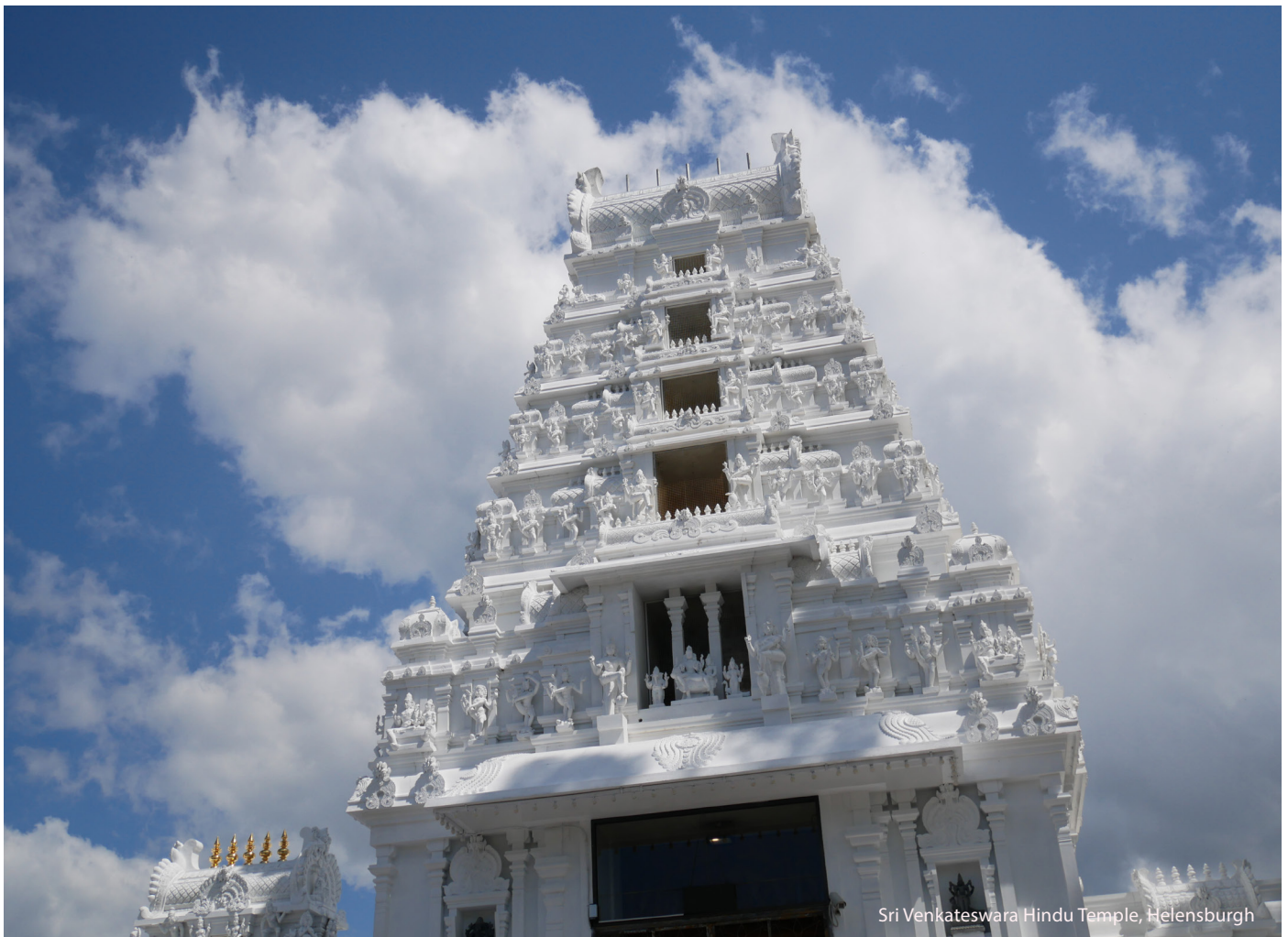
Sri Venkateswara Hindu Temple, Helensburgh

Heritage NSW Recommendation 2 - Identify the heritage items in your area and list them in your Local Environmental Plan