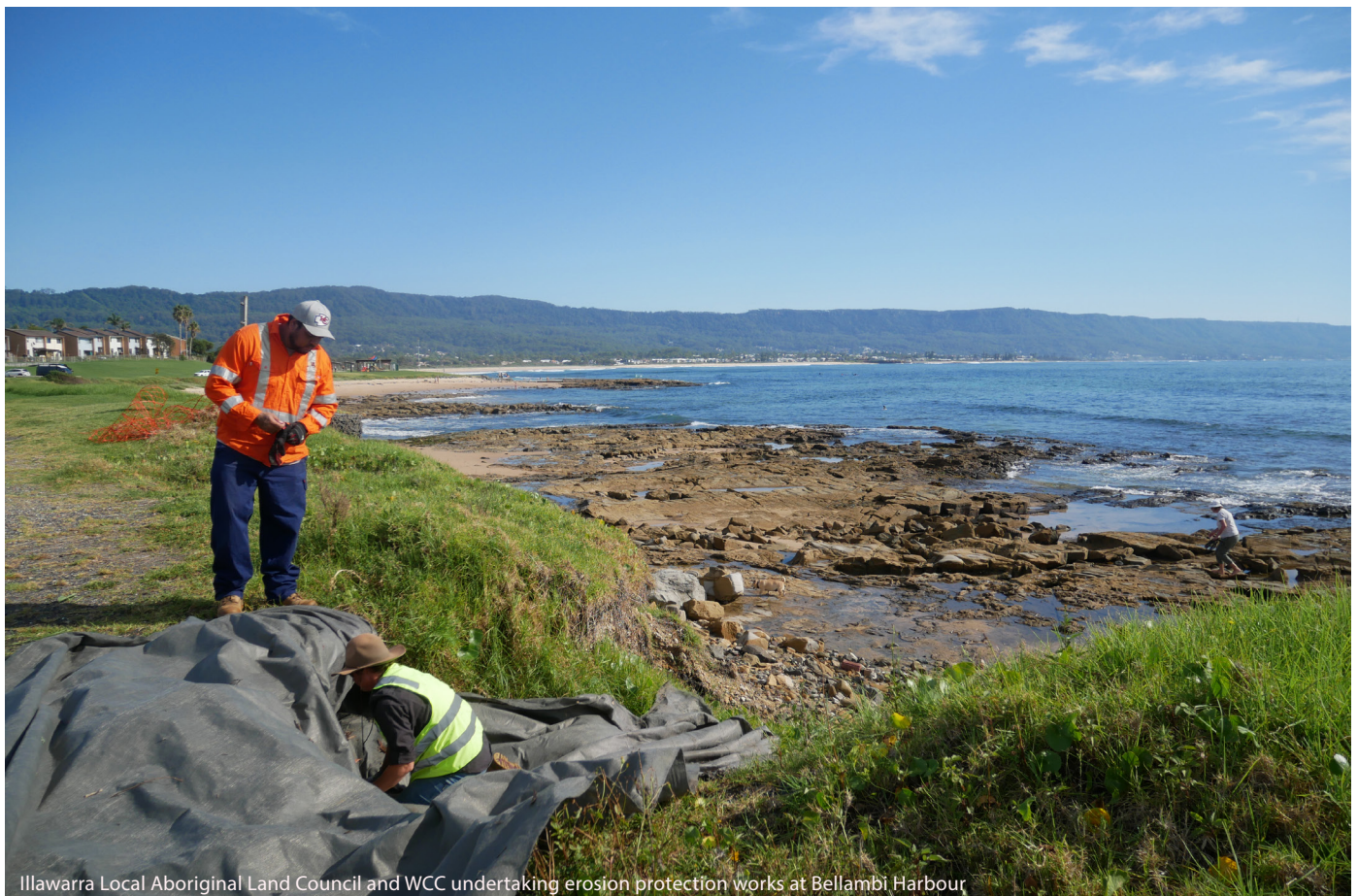
Illawarra Local Aboriginal Land Council and WCC undertaking erosion protection works at Bellambi Harbour

Council also acknowledges that opportunities to allow heritage buildings to meet modern sustainability outcomes are increasing through the development of new technologies. These innovations can be balanced with the heritage significance of these sites through appropriate management and decision making, with support and guidance from Council.