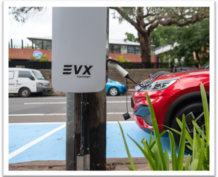
Kerbside line marking (example only)