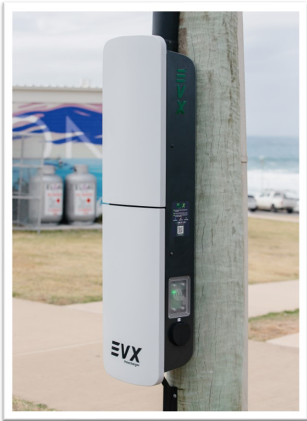
EV Charger - dimensions 370x1415mm