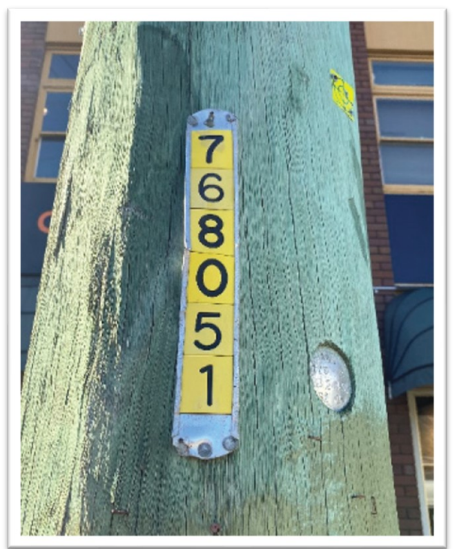
Pole number – 768051