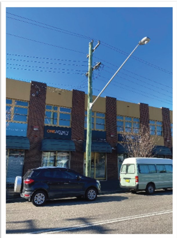
Pole location – 4 Railway Pde Thirroul