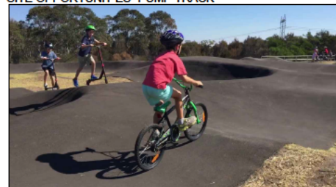
IMAGE OF 'BARDEN RIDGE PUMP TRACK' SUTHERLAND SHIRE COUNCIL