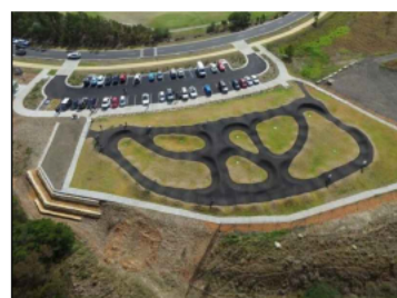
IMAGE OF 'BARDEN RIDGE PUMP TRACK' SUTHERLAND SHIRE COUNCIL