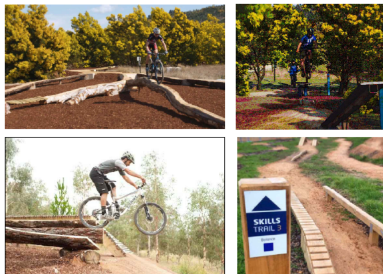
SITE OPPORTUNIT ES- PUMP TRACK