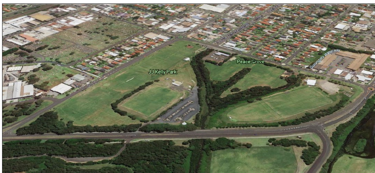
Figure 1: Aerial view of JJ Kelly Park