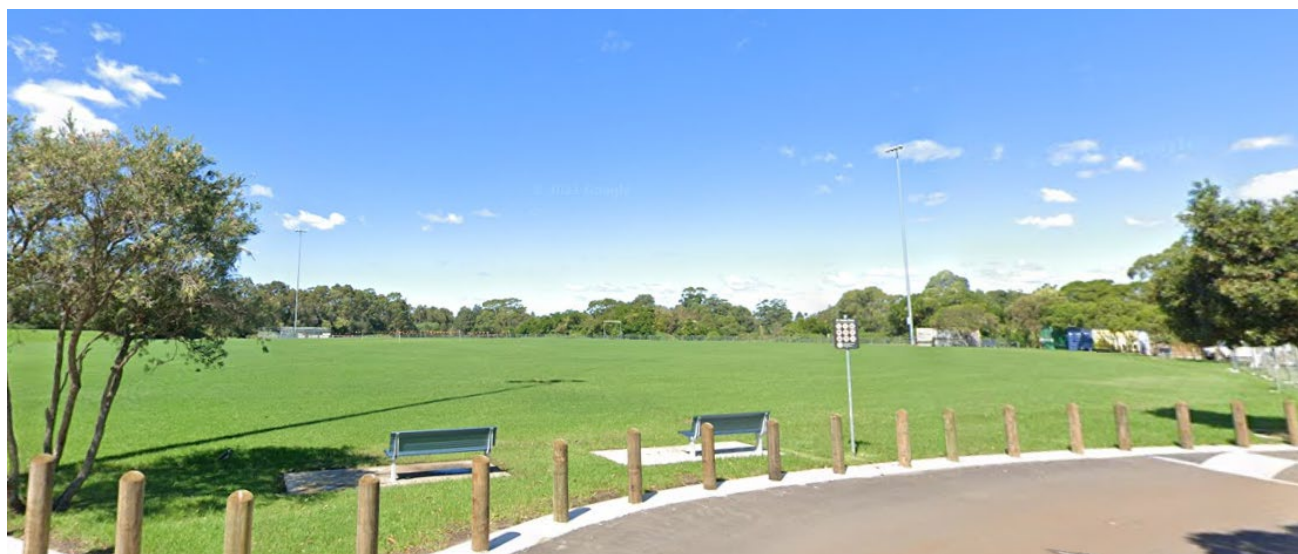
Figure 4 - Site as viewed from Cliff Street