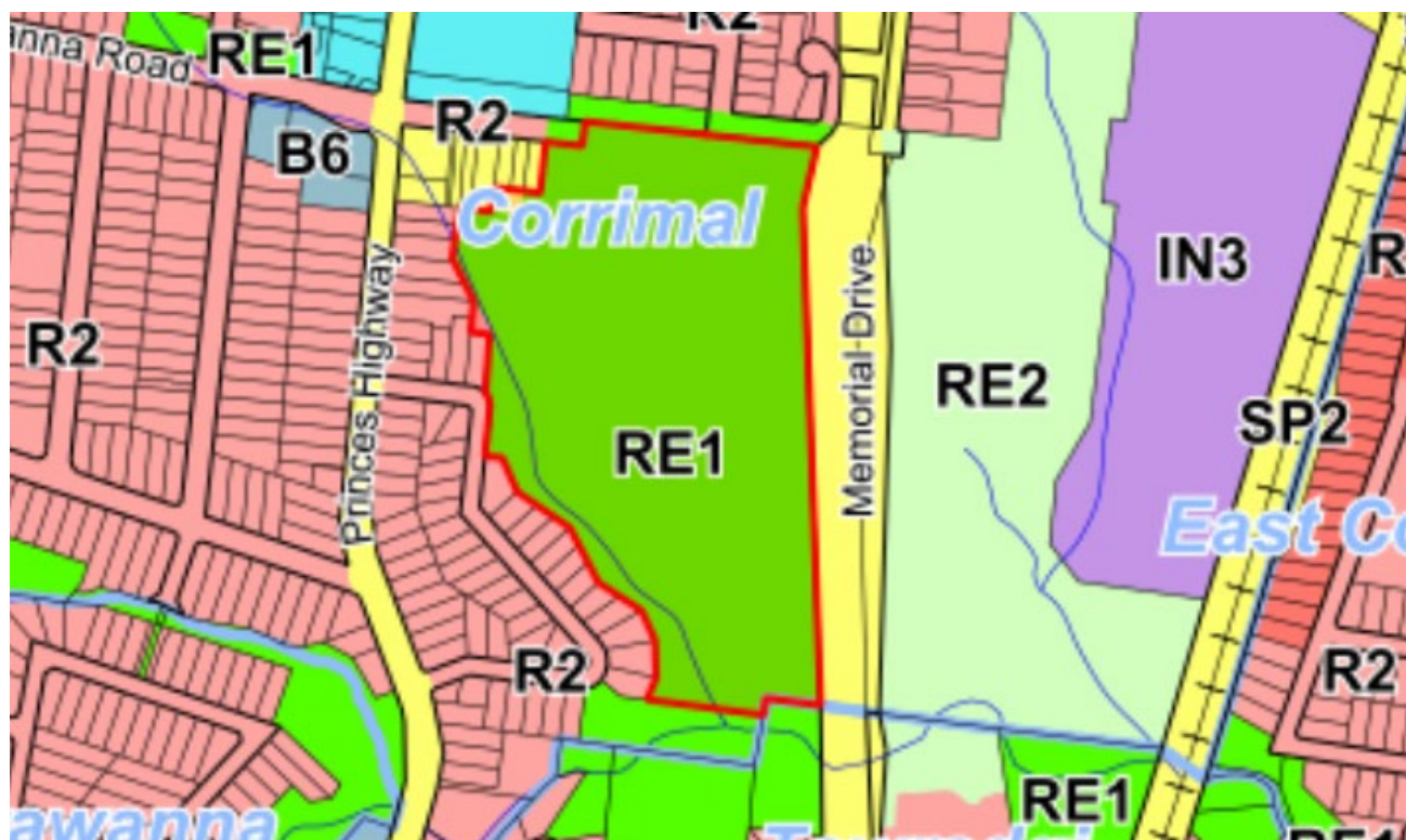
Figure 3: WLEP 2009 zoning map