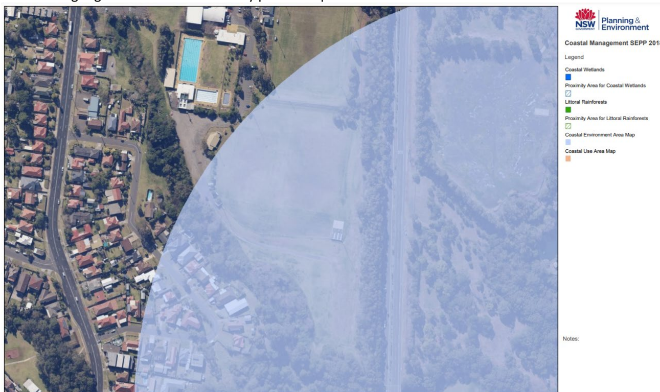
Figure 5: Excerpt from Coastal Management SEPP 2018 mapping

The Wollongong CZMP does not have any particular provisions for lot 101 DP 1062386.