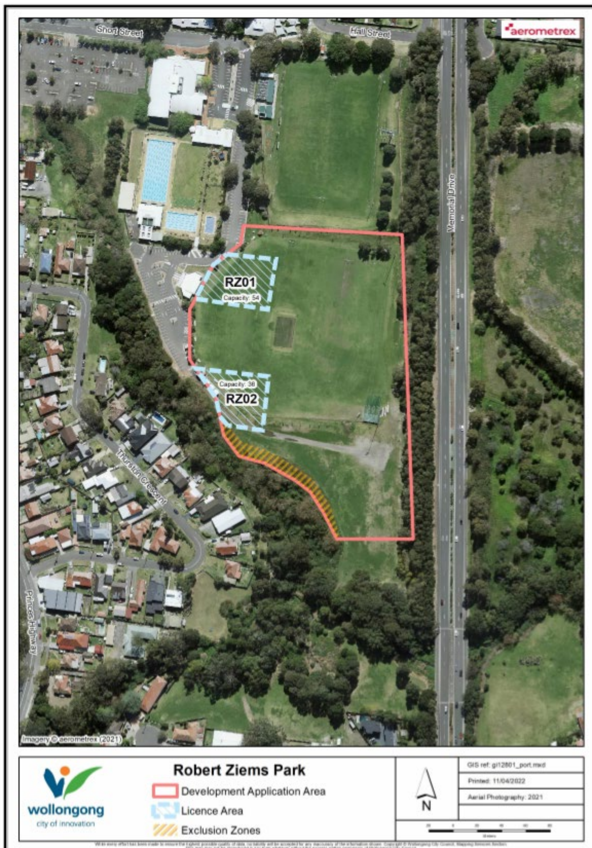
Figure 2: Aerial photograph and proposed lease area