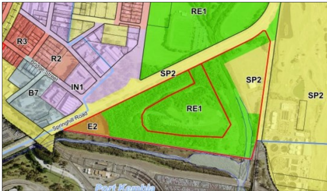
WLEP 2009 Zoning Map