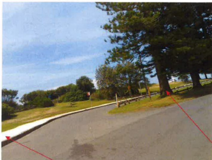
North approach on cycleway, detoured at Pram Crossing