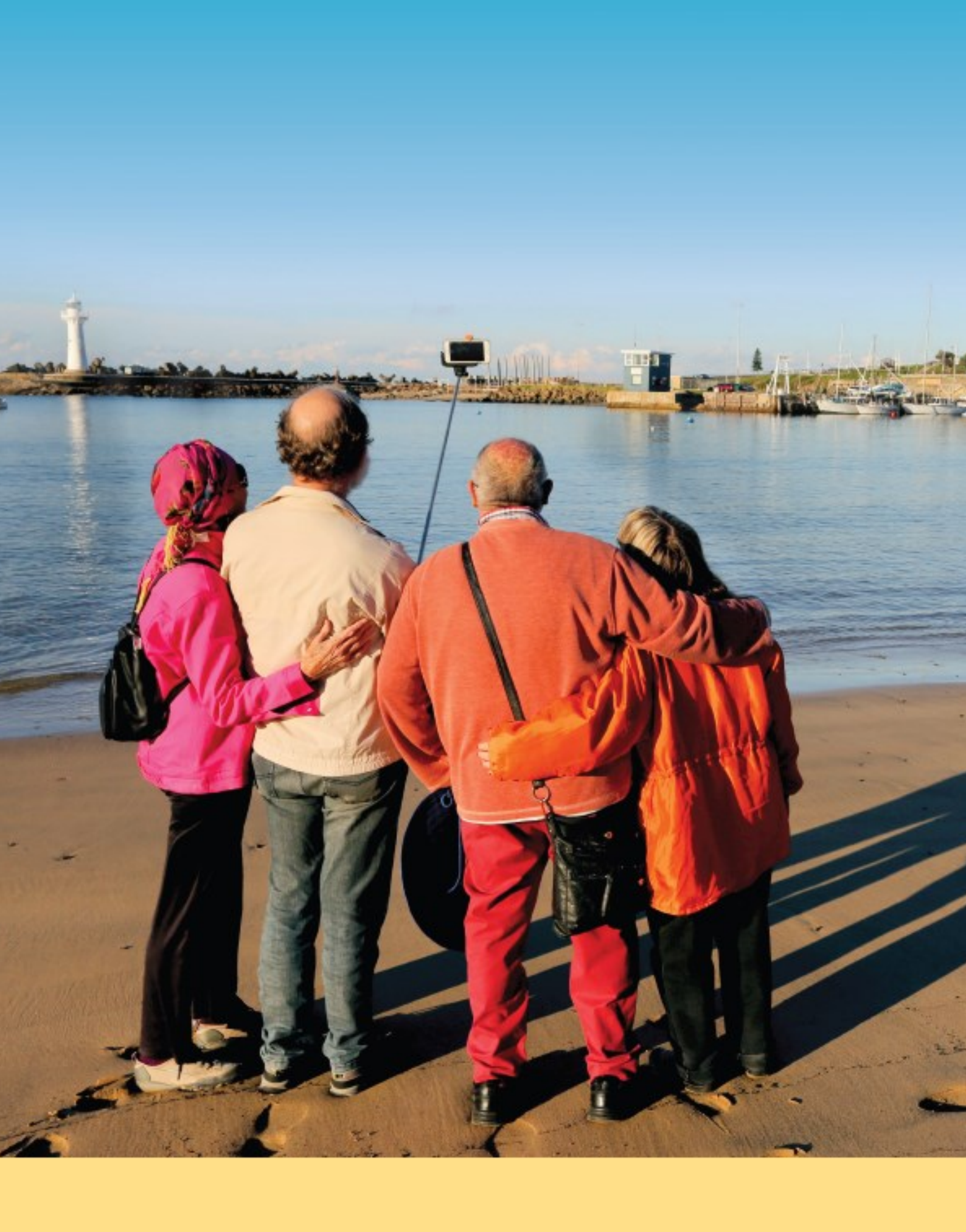
Involved Connected Valued