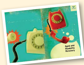
Aged and Disability Directory