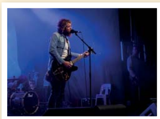
Viva la Gong Festival