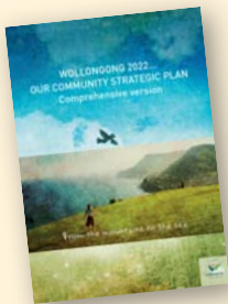
Community Strategic Plan

Council has one Vision, one Program and one Plan. This is the Community Strategic Plan, Delivery Program and Annual Plan. The Ageing Plan is a supporting document that will inform the actions in our Annual Plan.