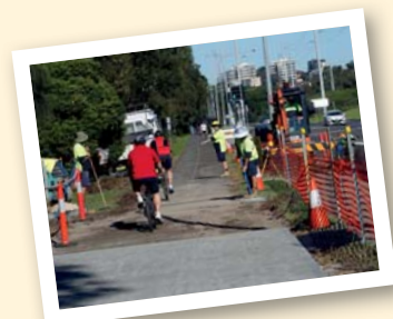
Construction of Puckey's shared pathway