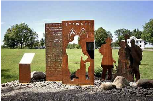
PUBLIC ART FOR HERITAGE INTERPRETATION