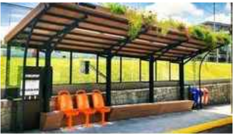
UPGRADED BUS SHELTER