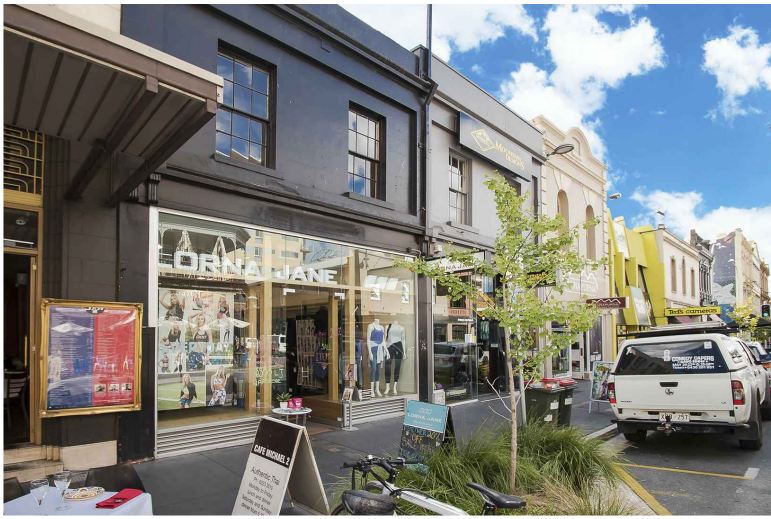
RAIN GARDENS AND FEATURE TREES