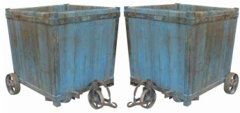
TIMBER TREE PLANTERS