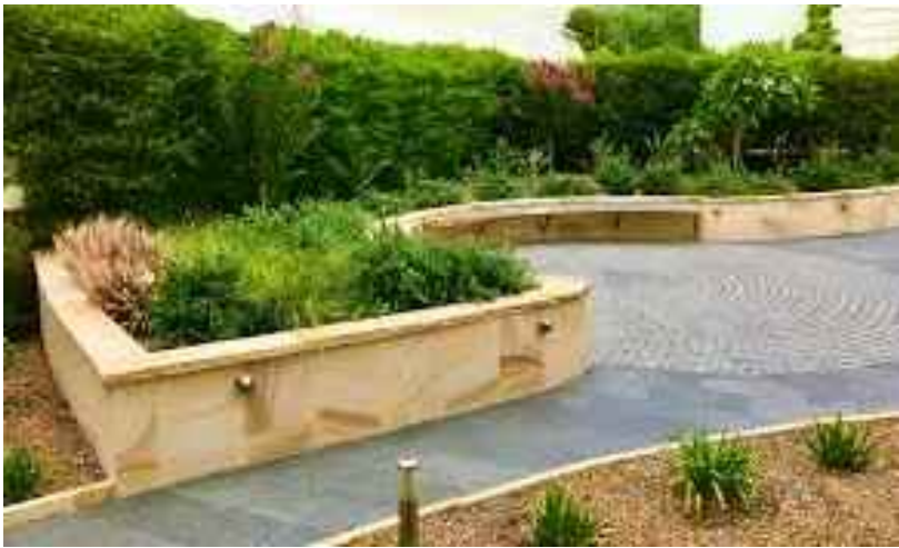
SANDSTONE SITTING WALLS - EXAMPLE FOR OUTDOOR COMMUNITY SPACES