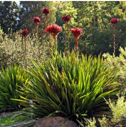
GYMEA LILLIES AS ACCENT PLANTING