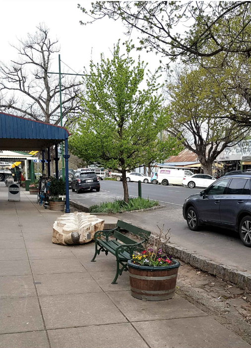
PUBLIC ART, SEATING AND FLOWERING PLANTS