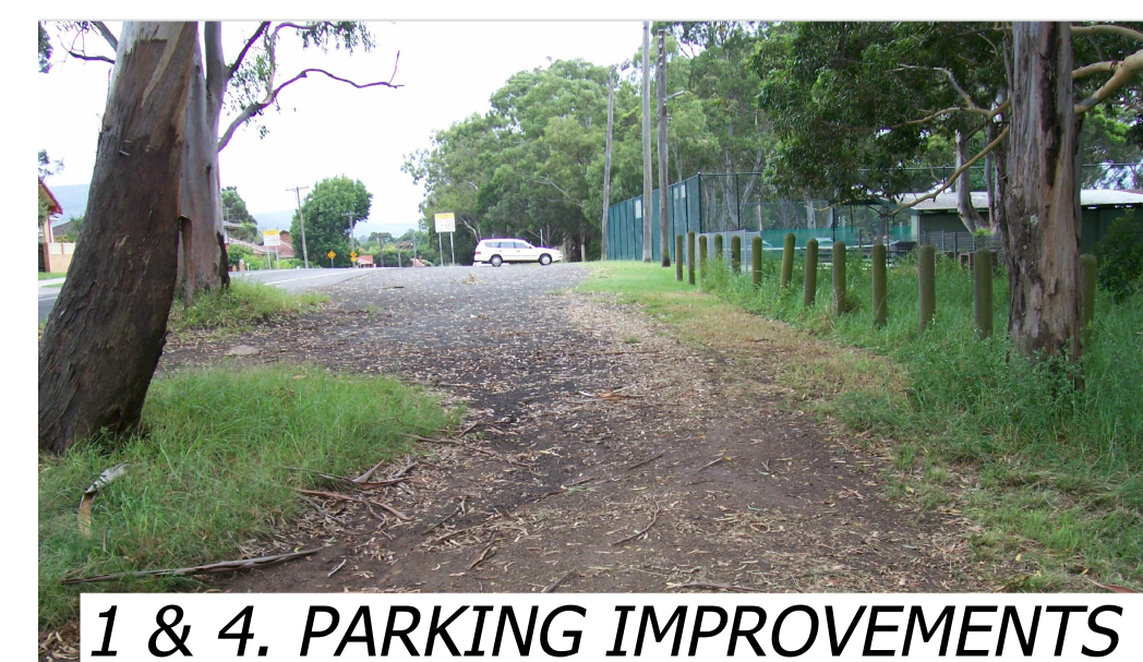
1 & 4. PARKING IMPROVEMENTS