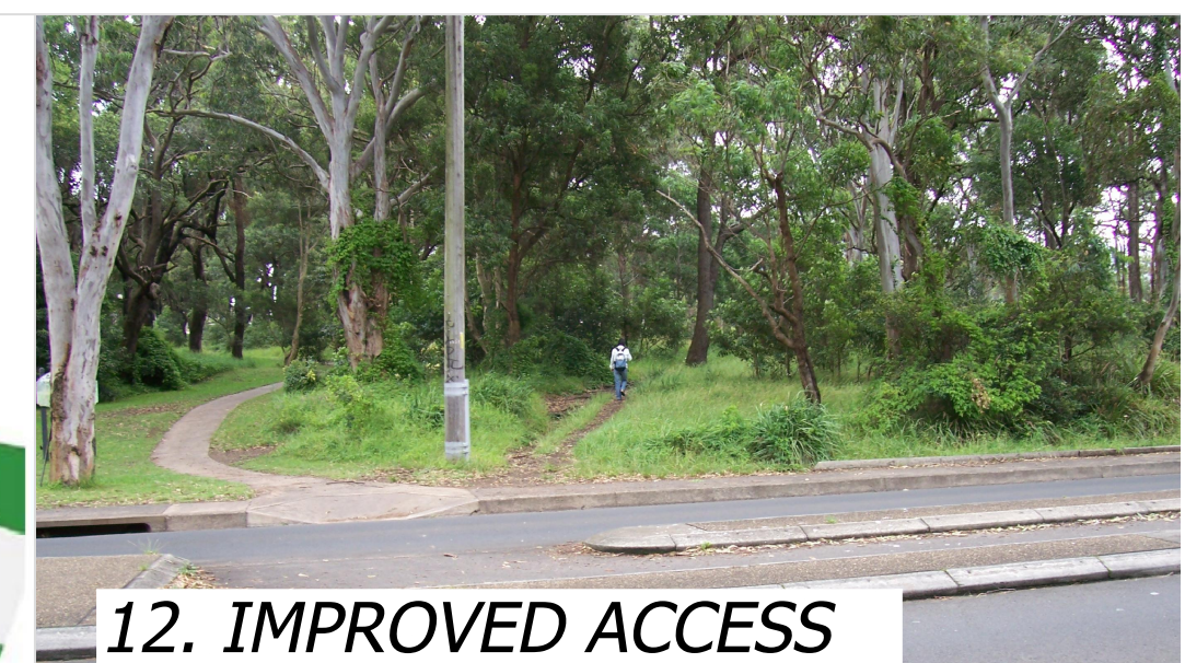
12. IMPROVED ACCESS