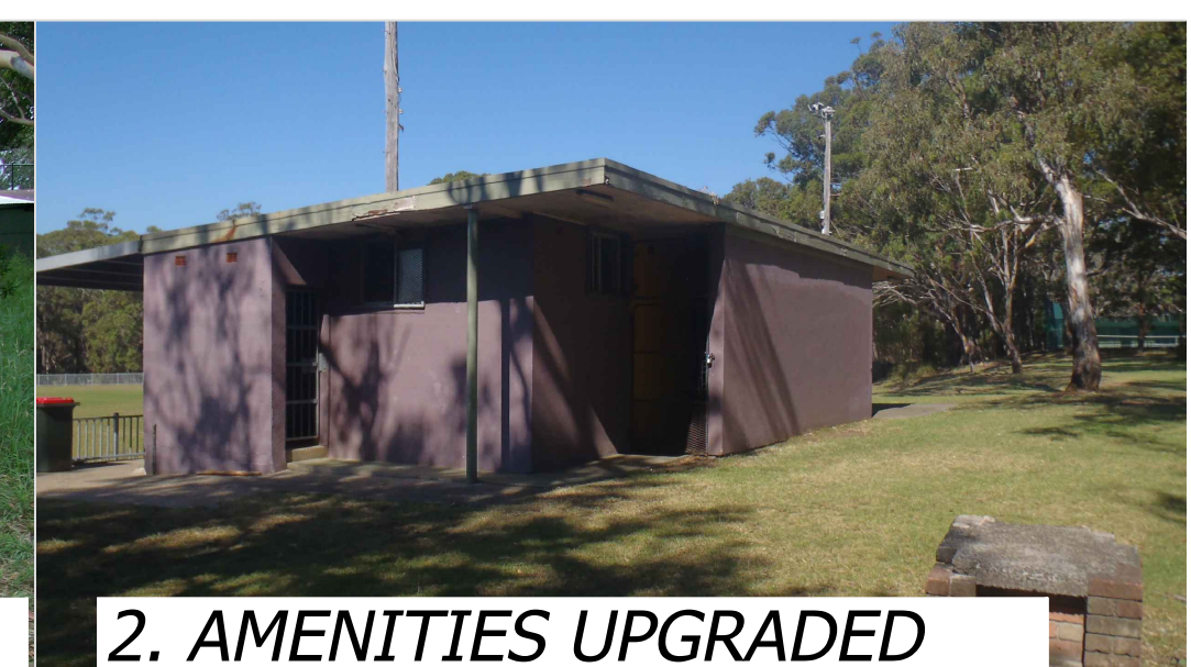
2. AMENITIES UPGRADED