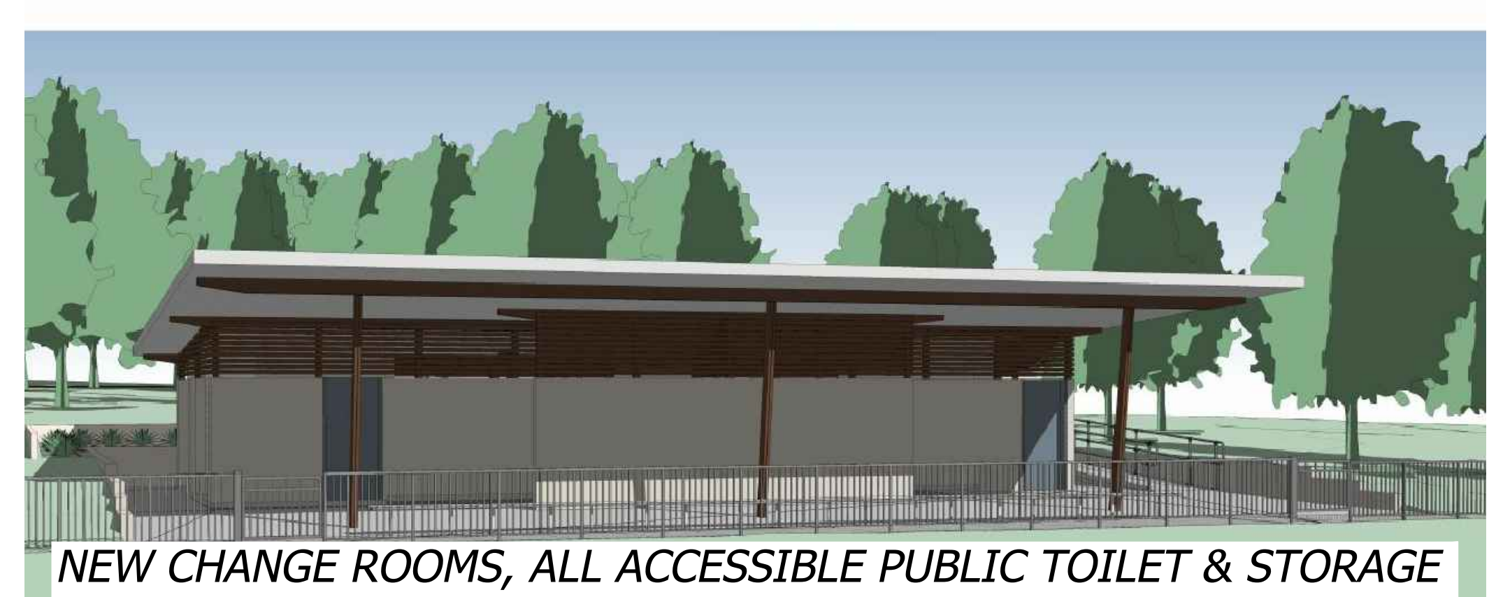
NEW CHANGE ROOMS, ALL ACCESSIBLE PUBLIC TOILET & STORAGE