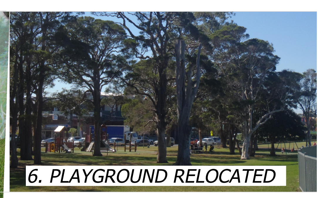
6. PLAYGROUND RELOCATED