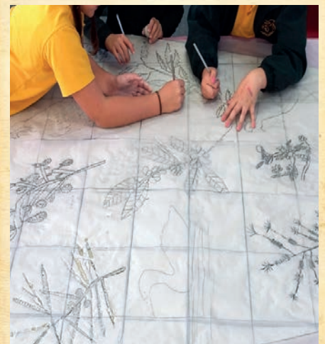
Children participating in tile design.