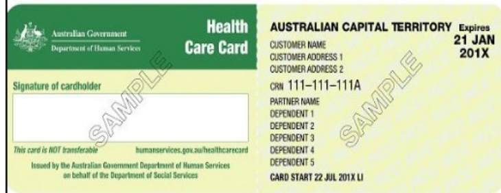
Health Care Card Issued by Department of Health and Human Services

One of them will need to show my name and address such as a concession card.