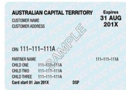
Pensioner Concession Card issued by the Department of Health and Human Services

I will be asked a few questions and given some information about what I can borrow.