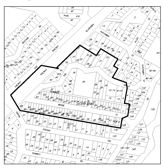
Figure 4: Austinmer Heritage Conservation Area