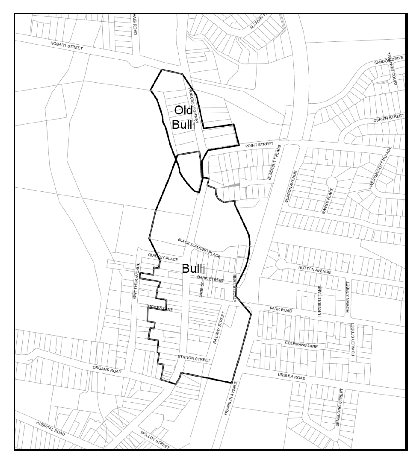
Figure 3: Old Bulli and Bulli Heritage Conservation Areas