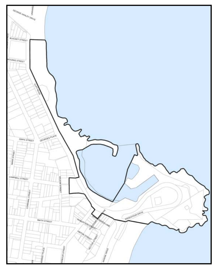
Figure 1: North Beach Precinct and Belmore Basin Heritage Conservation Area

8. The Continental Baths were officially opened on 24 March 1928 and included open air dressing sheds with separate areas for gentlemen and ladies, single and double dressing benches, facilities included showers and toilets. In the 1980's the original dressing shed was demolished due to a