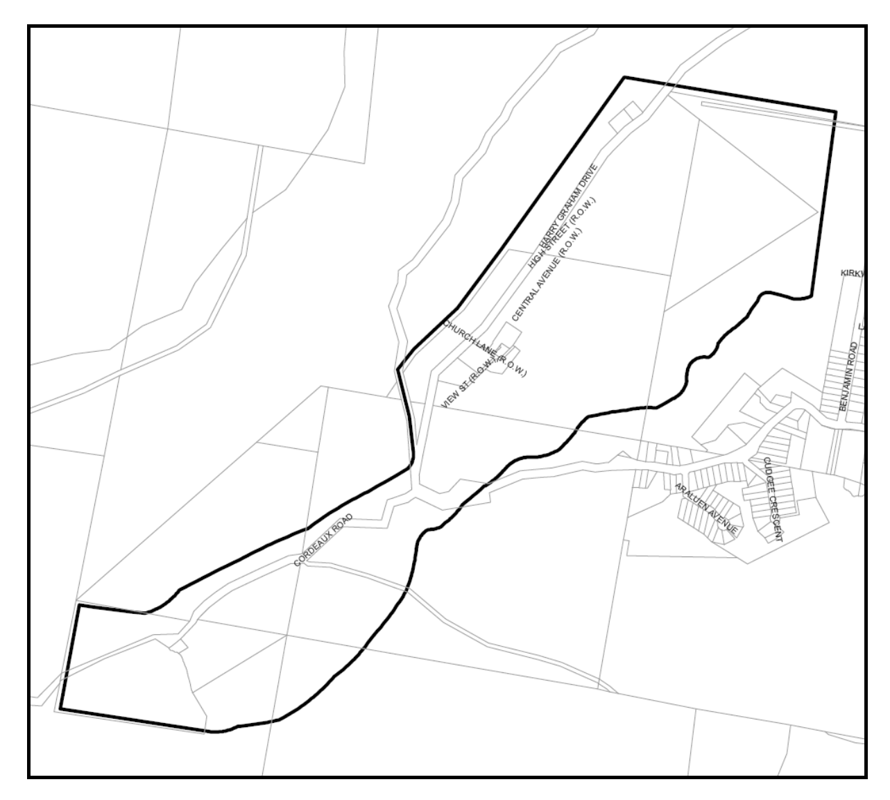
Figure 2: Kembla Heights Heritage Conservation Area