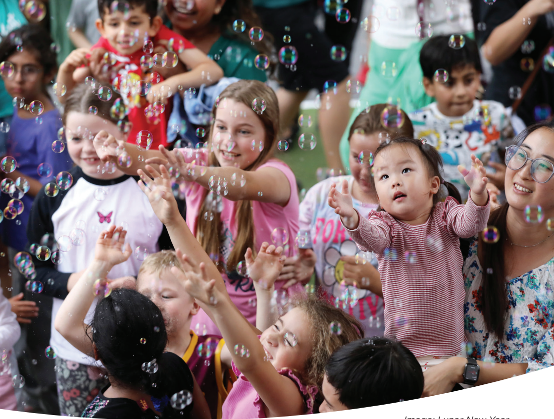
Image: Lunar New Year