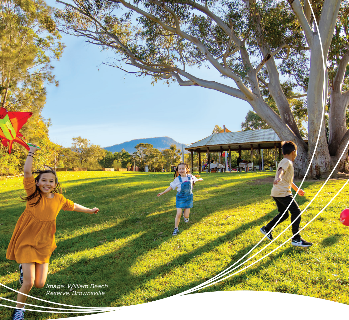
Image: William Beach Reserve, Brownsville