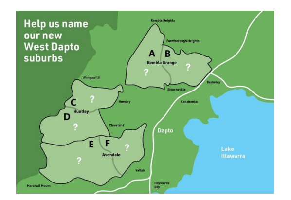
C Lindsay or Woolangurry or Murringah Horsley D Huntley Avondale Woolangurry Murrindarry Avondale Yallah