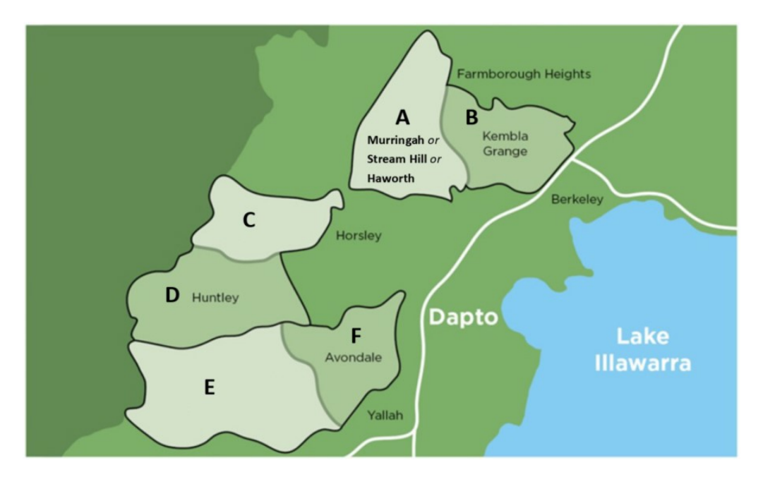
Figure 5: Suburb 'A' shortlist

On 19 July 2021, Council endorsed the proposed short list of names for Suburb 'A' for a six (6) week public exhibition period. The community indicated a preference for Stream Hill, from the three exhibited names, and there was also some support for Murringah. Murringah was nominated by the Aboriginal working group as a potential name for the proposed suburb. However, a member of the Aboriginal community advised that the name was considered offensive to some members of the Aboriginal community.